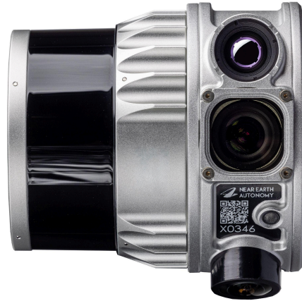
Near Earth's Firefly Compact, Aircraft-Agnostic Autonomy System for Uncrewed Maritime Operations

Near Earth's Firefly compact autonomy system is designed for integration with a wide variety of aircraft. Weighing just 2 pounds, Firefly is light enough to be incorporated into a broad range of Class 3 and Class 4 aircraft, greatly expanding its applicability across the uncrewed aviation ecosystem. It has been successfully integrated on platforms including BAE, L3 Harris, and Pterodynamics. Multiple capabilities will be matured under the contract, including autonomous confined area operations, ship recovery in emissions-controlled (EMCON) environments, and GPS-free navigation.