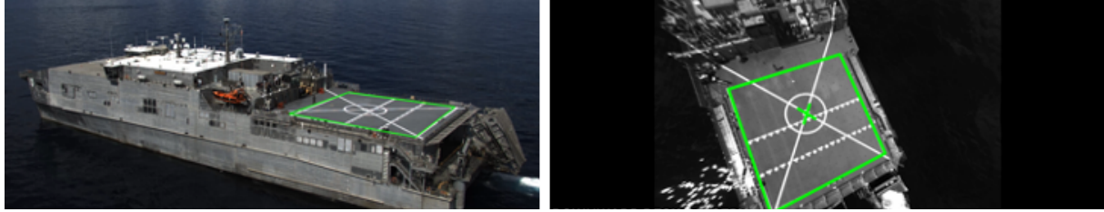
Near Earth's technology performing ship deck tracking on previous DoD programs

This development will build on Near Earth's 13+ years of innovation for defense programs. The progression began with Autonomous Aerial Cargo/Utility System (AACUS) , which pioneered rotorcraft autonomy for Marine Corps resupply. Building on this, Near Earth miniaturized the Joint Capability Technology Demonstration (JCTD) system for Unmanned Logistics Systems Air (ULS-A) , proving autonomy for small UAS in confined areas. NAVAIR selected Near Earth Autonomy for the USMC Aerial Logistics Connector Program to demonstrate optimized logistics using rotorcraft. The Firefly system represents the latest advancement, enabling small cargo UAS operations for programs like the Marine Corps' Tactical Resupply Unmanned Aircraft System (TRUAS) .